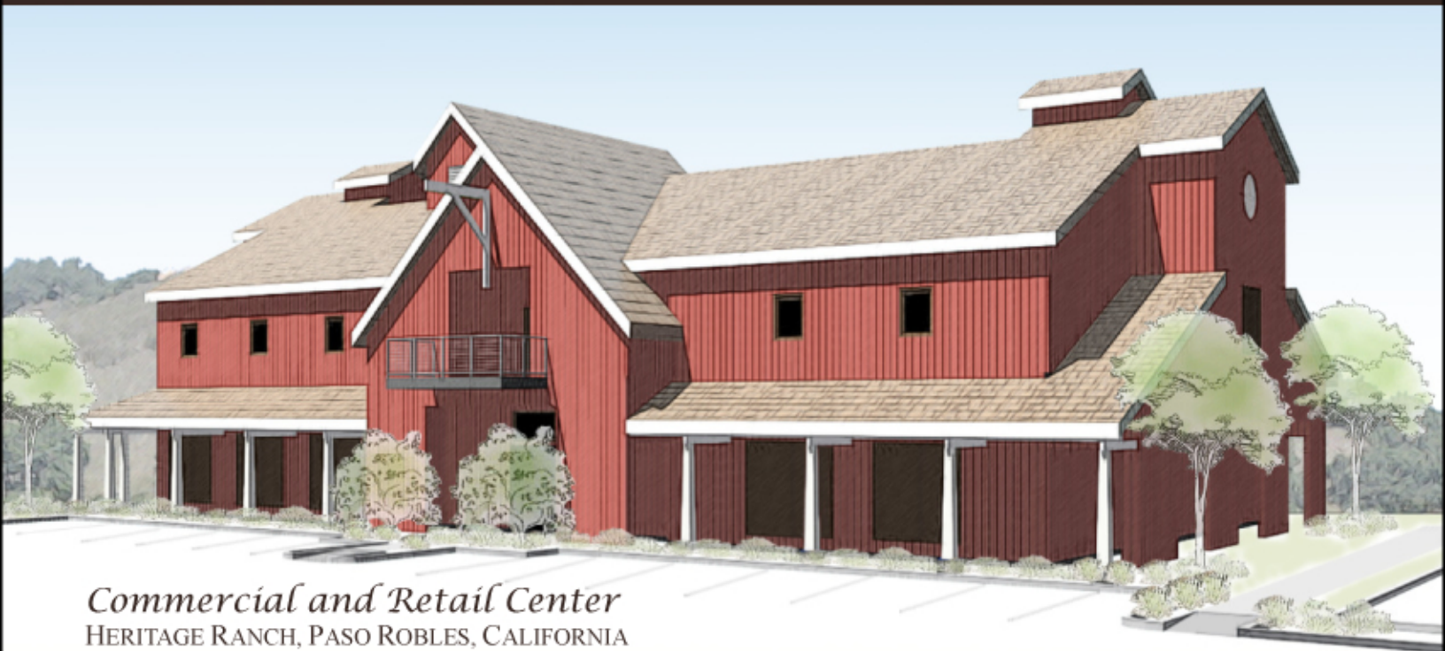
Commercial and Retail Center HERITAGE RANCH, PASO ROBLES, CALIFORNIA